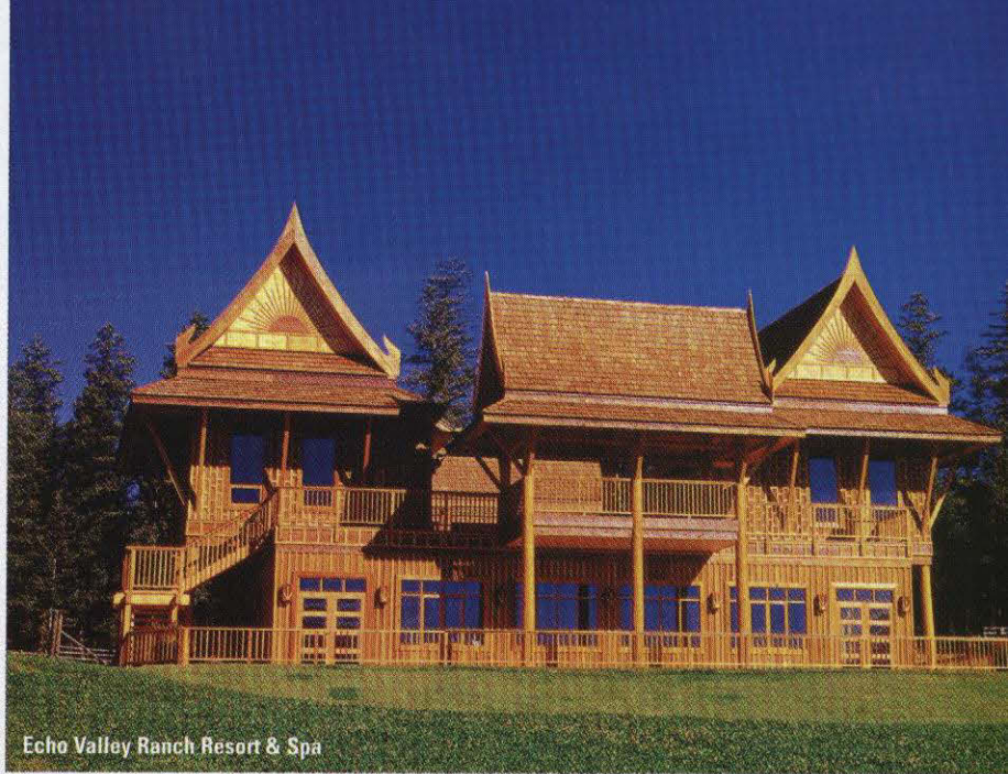
Echo Valley Ranch Resort & Spa

In the heart of the Cariboo, British Columbia's cowboy country, Echo Valley Ranch Resort & Spa is one of the more unusual destinations you'll come across. Lying amidst four different geographic regions called biomes, Echo Valley's range of eco adventures are extraordinary; few places can offer landscapes of mountains and marshlands, desert canyons and boreal forests all within a batter's reach. Add a touch of Thai styling and you quickly see why Echo Valley is so interesting. Meetings take place in the modern, multi-purpose Baan Thai pavilion (the only one of its kind in North America), designed by the architect of the Thai royal family. Staff can incorporate any number of customized team-building exercises or outdoor activities or guests can enjoy the ranch's extensive spa, which showcases some of Thailand's finest healing practices. Between 26 and 40 guests stay in beautifully appointed